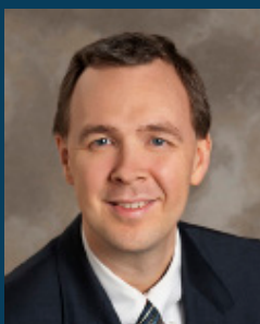
Dr. Sooley Upper Cervical Chiropractor

In conclusion, if digestive problems are affecting your quality of life, remember that there are options beyond traditional medications and surgeries. Upper Cervical care might be the key to not just managing symptoms but potentially restoring your digestive system to its natural, healthy state. If you're considering this treatment, reach out to an Upper Cervical chiropractor to discuss your specific needs and take a step towards better digestive health.